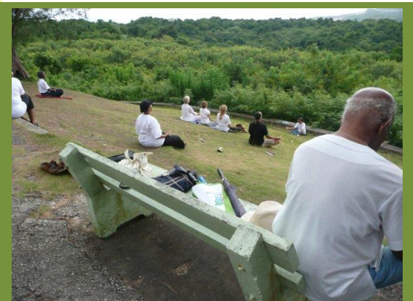
Time for meditation at Farley Hill