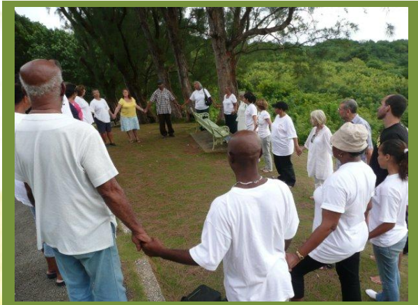
Participants in the first Gathering in Barbados in 2009 enjoy an outdoor session at Farley Hill National Park

Interested persons should visit the Barbados Reiki Association's website for full details, including price, programme and registration fee and to take early advantage of group rates for airfare for persons travelling from Barbados.